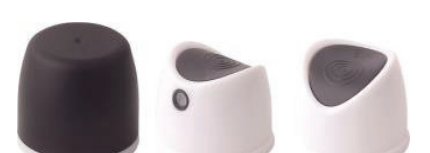
AQ100 -74+OQ -313