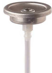
1" Female Valve