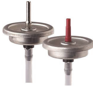
Lighter Gas Refilled Valve