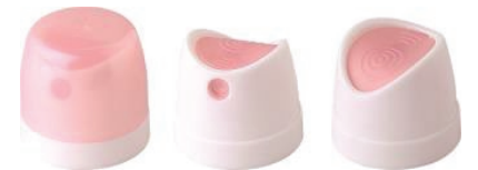
AQ100 -71+OQ -311