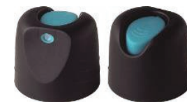
AQ100 -55+OQ -241-A