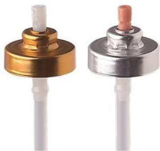
20mm Continuous Valve