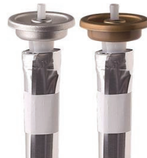
1" Bag On Valve (Male)