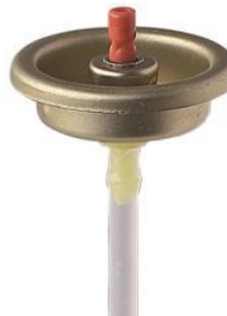
Gold Lacquered Tinplate