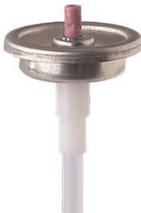
1" 360 Degree Valve (One Chamber)