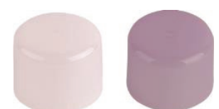
UV CAP OP -28