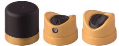
AQ100 -77+OQ -310