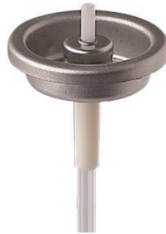
1" Metered Valve