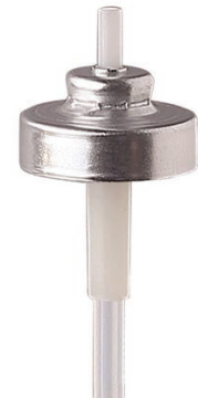
20mm Metered Valve