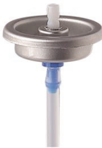
Clear Lacquered Tinplate