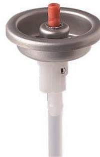
1" 360 Degree Valve (Two Chamber)